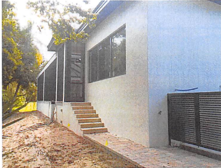
LEFT REAR 09/10/2015

If submitting more photographs than will fit on the preceding page, affix the additional photographs below. Identify all photographs with: date taken; "Front View" and "Rear View"; and, if required, "Right Side View" and "Left Side View." When applicable, photographs must show the foundation with representative examples of the flood openings or vents, as indicated in Section A8.