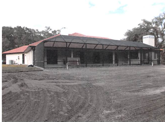
REAR VIEW 1-9-15