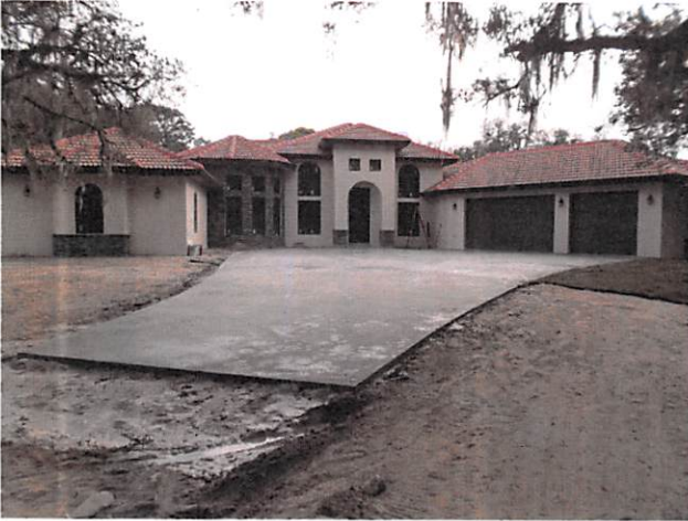
FRONT VIEW 1-9-15

If using the Elevation Certificate to obtain NFIP flood insurance, affix at least 2 building photographs below according to the instructions for Item A6. Identify all photographs with date taken; "Front View" and "Rear View"; and, if required, "Right Side View" and "Left Side View." When applicable, photographs must show the foundation with representative examples of the flood openings or vents, as indicated in Section A8. If submitting more photographs than will fit on this page, use the Continuation Page.