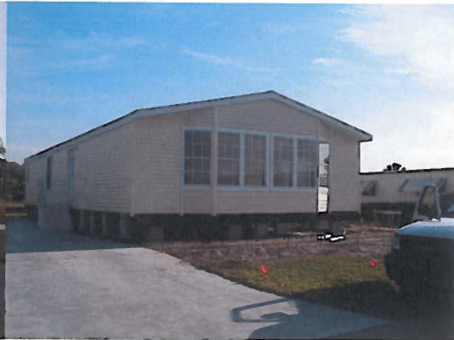
RIGHT VIEW 5/7/09