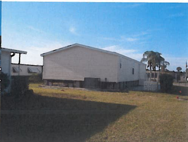
LEFT VIEW 5/7/09