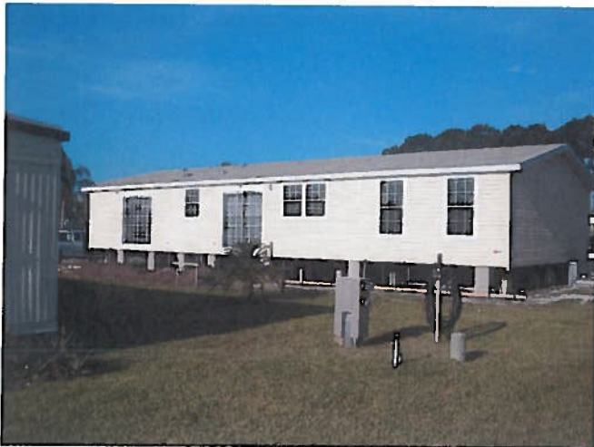
REAR VIEW 5/7/09