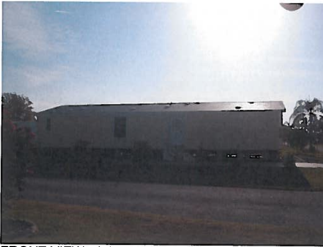
FRONT VIEW 5/7/09

If using the Elevation Certificate to obtain NFIP flood insurance, affix at least two building photographs below according to the instructions for Item A6. Identify all photographs with: date taken; "Front View" and "Rear View"; and, if required, "Right Side View" and "Left Side View." If submitting more photographs than will fit on this page, use the Continuation Page on the reverse.