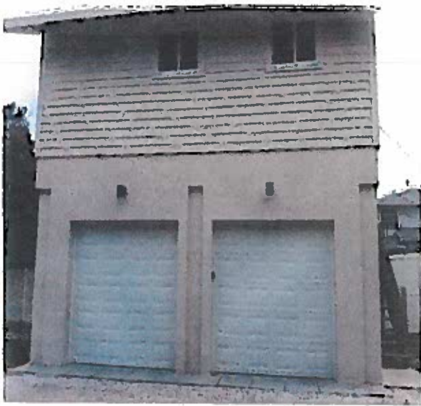
FRONT VIEW 12-23-2011

If using the Elevation Certificate to obtain NFIP flood insurance, affix at least two building photographs below according to the instructions for Item A6. Identify all photographs with: date taken; "Front View" and "Rear View"; and, if required, "Right Side View" and "Left Side View." If submitting more photographs than will fit on this page, use the Continuation Page, following.