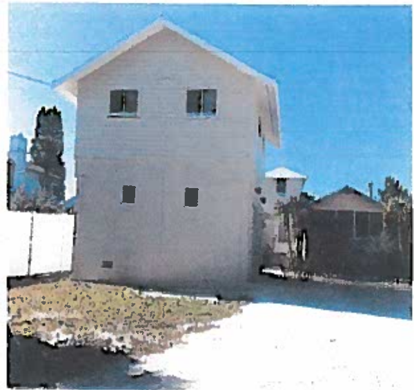
REAR VIEW 12-23-2011