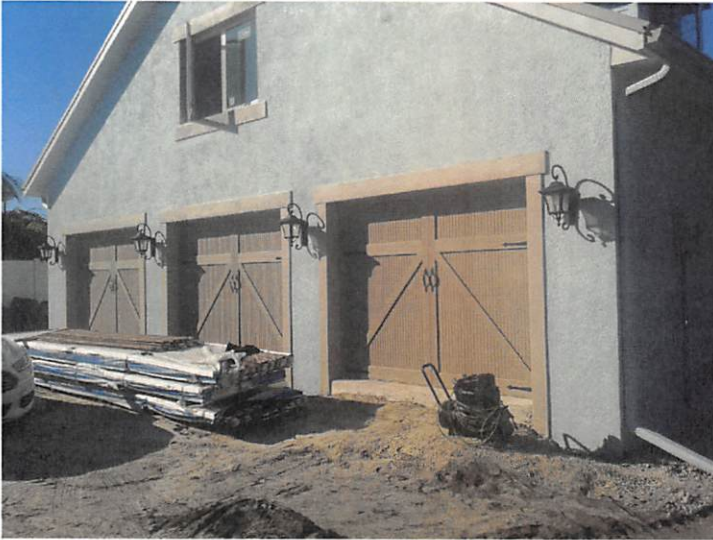
FRONT VIEW 12/8/15

If using the Elevation Certificate to obtain NFIP flood insurance, affix at least 2 building photographs below according to the instructions for Item A6. Identify all photographs with date taken; "Front View" and "Rear View"; and, if required, "Right Side View" and "Left Side View." When applicable, photographs must show the foundation with representative examples of the flood openings or vents, as indicated in Section A8. If submitting more photographs than will fit on this page, use the Continuation Page.