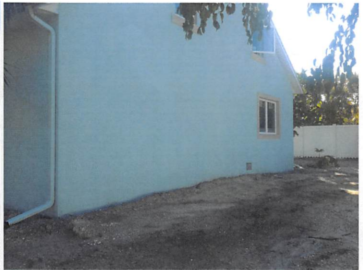
REAR VIEW 12/8/15