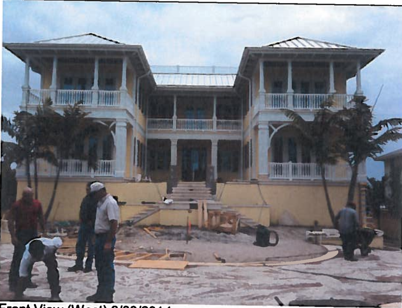
Front View (West) 3/30/2014

If using the Elevation Certificate to obtain NFIP flood insurance, affix at least two building photographs below according to the instructions for Item A6. Identify all photographs with: date taken; "Front View" and "Rear View"; and, if required, "Right Side View" and "Left Side View." If submitting more photographs than will fit on this page, use the Continuation Page, following.