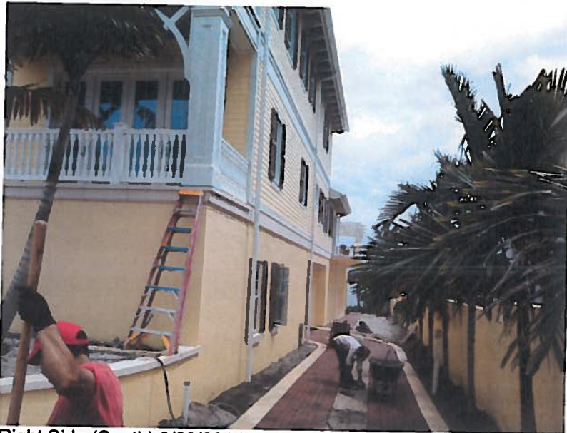
Right Side (South) 3/30/2014