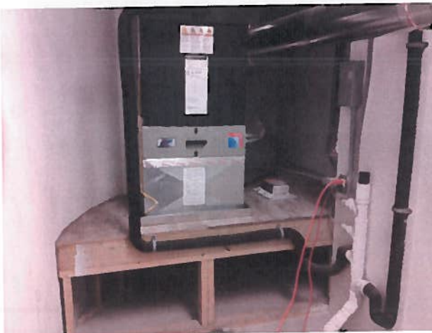
Air Conditioning Unit 3/30/2014