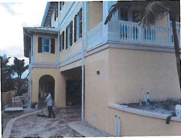
Left Side (North) 3/30/2014