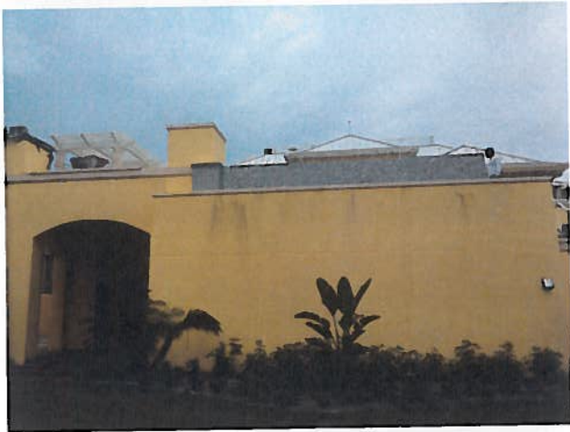
Rear View (East) 3/30/2014