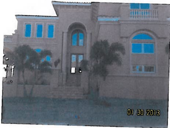
FRONT VIEW 1-30-13

If using the Elevation Certificate to obtain NFIP flood insurance, affix at least 2 building photographs below according to the instructions for Item A6. Identify all photographs with date taken; "Front View" and "Rear View"; and, if required, "Right Side View" and "Left Side View." When applicable, photographs must show the foundation with representative examples of the flood openings or vents, as indicated in Section A8. If submitting more photographs than will fit on this page, use the Continuation Page.