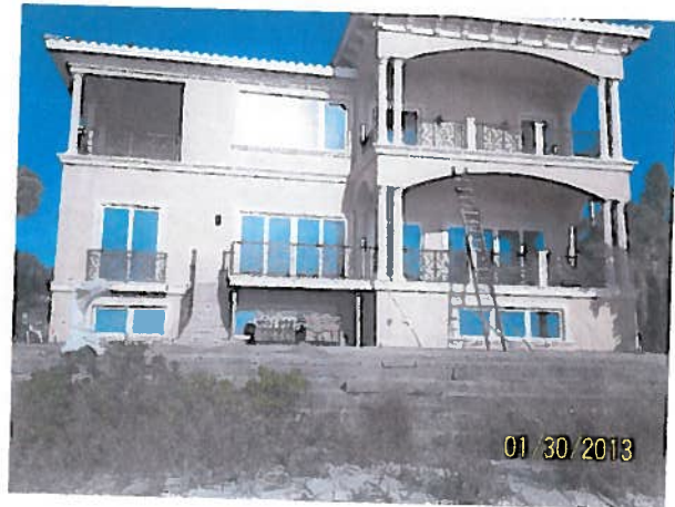
REAR VIEW 1-30-13