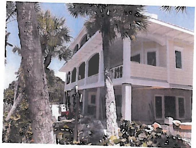
REAR VIEW 9-2-14