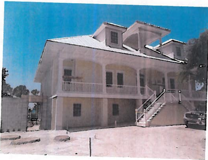
FRONT VIEW 9-2-14

If using the Elevation Certificate to obtain NFIP flood insurance, affix at least 2 building photographs below according to the instructions for Item A6. Identify all photographs with date taken; "Front View" and "Rear View"; and, if required, "Right Side View" and "Left Side View." When applicable, photographs must show the foundation with representative examples of the flood openings or vents, as indicated in Section A8. If submitting more photographs than will fit on this page, use the Continuation Page.