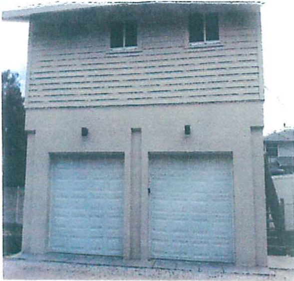
FRONT VIEW 12-23-2011

If using the Elevation Certificate to obtain NFIP flood insurance, affix at least two building photographs below according to the instructions for Item A6. Identify all photographs with: date taken; "Front View" and "Rear View"; and, if required, "Right Side View" and "Left Side View." If submitting more photographs than will fit on this page, use the Continuation Page, following.