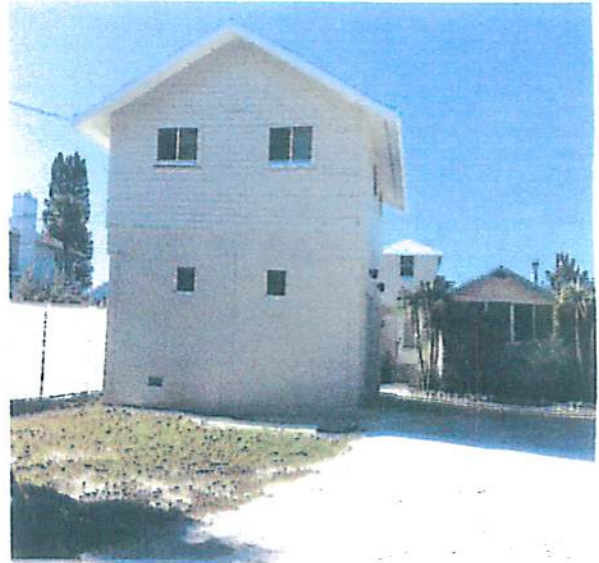
REAR VIEW 12-23-2011