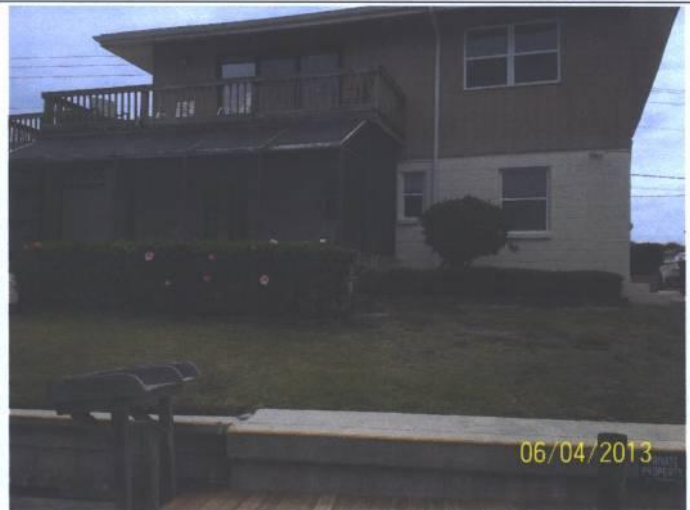
REAR VIEW 6/4/13