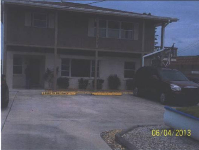
FRONT VIEW 6/4/13

If using the Elevation Certificate to obtain NFIP flood insurance, affix at least 2 building photographs below according to the instructions for Item A6. Identify all photographs with date taken; "Front View" and "Rear View"; and, if required, "Right Side View" and "Left Side View." When applicable, photographs must show the foundation with representative examples of the flood openings or vents, as indicated in Section A8. If submitting more photographs than will fit on this page, use the Continuation Page.