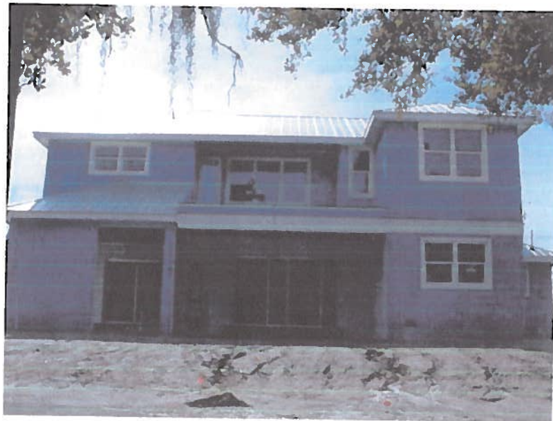
REAR VIEW AT 420 CEZANNE DRIVE, OSPREY, FL 34229