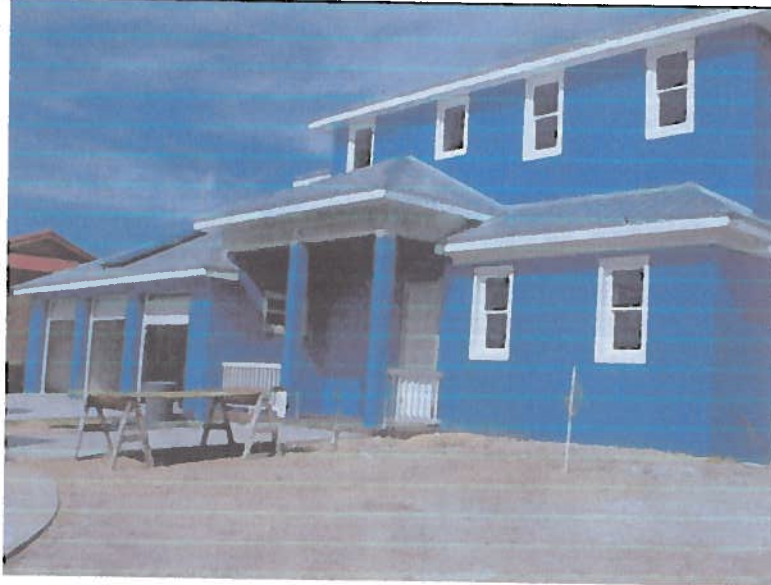
FRONT VIEW AT 420 CEZANNE DRIVE, OSPREY, FL 34229