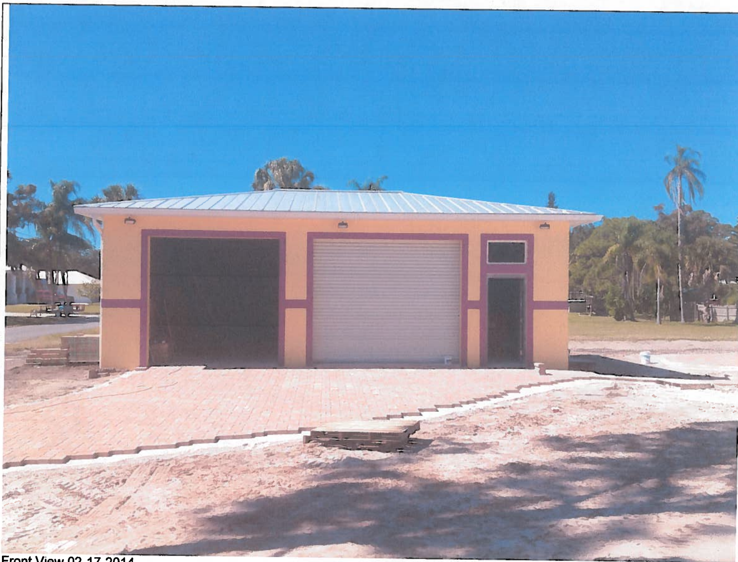
Front View 02-17-2014

If using the Elevation Certificate to obtain NFIP flood insurance, affix at least 2 building photographs below according to the instructions for Item A6. Identify all photographs with date taken; "Front View" and "Rear View"; and, if required, "Right Side View" and "Left Side View." When applicable, photographs must show the foundation with representative examples of the flood openings or vents, as indicated in Section A8. If submitting more photographs than will fit on this page, use the Continuation Page.