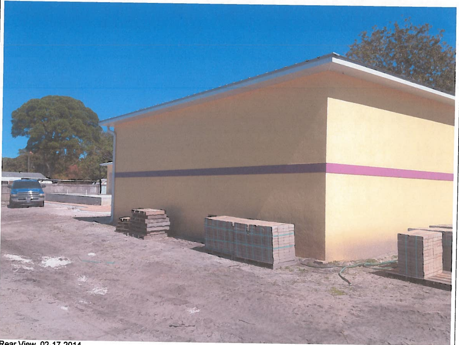
Rear View 02-17-2014

If submitting more photographs than will fit on the preceding page, affix the additional photographs below. Identify all photographs with: date taken; "Front View" and "Rear View"; and, if required, "Right Side View" and "Left Side View." When applicable, photographs must show the foundation with representative examples of the flood openings or vents, as indicated in Section A8.