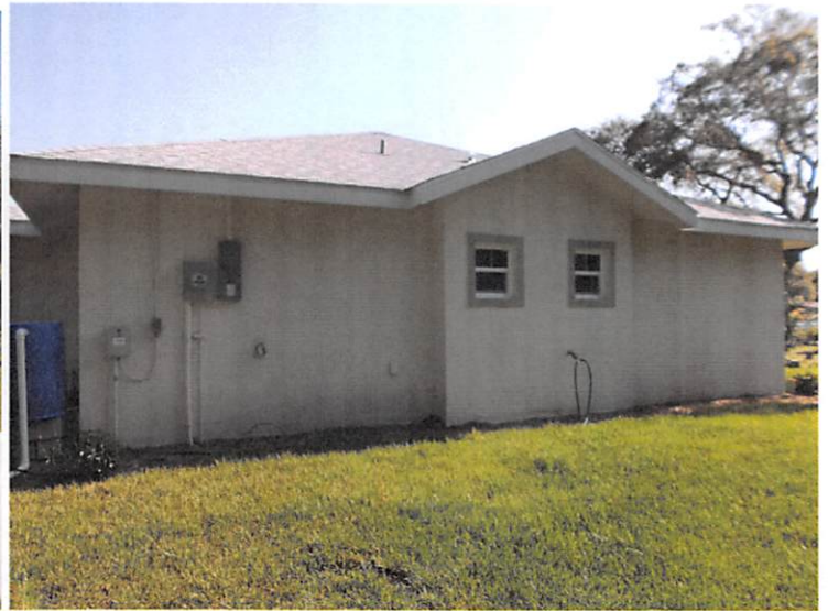
FRONT VIEW 5-18-15