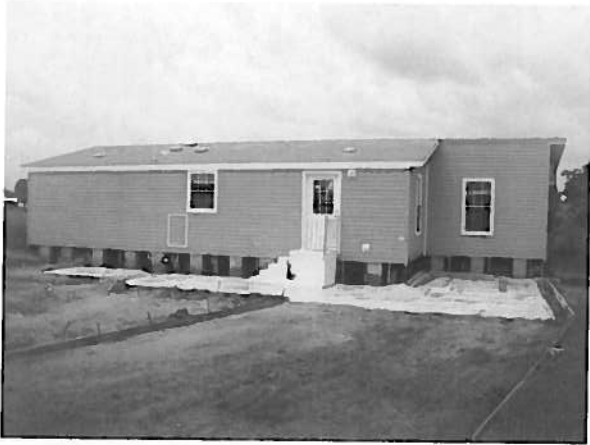
FRONT VIEW 8-31-10