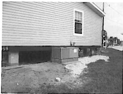
AC UNIT 8-31-10