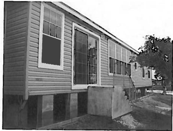
REAR VIEW 8-31-10