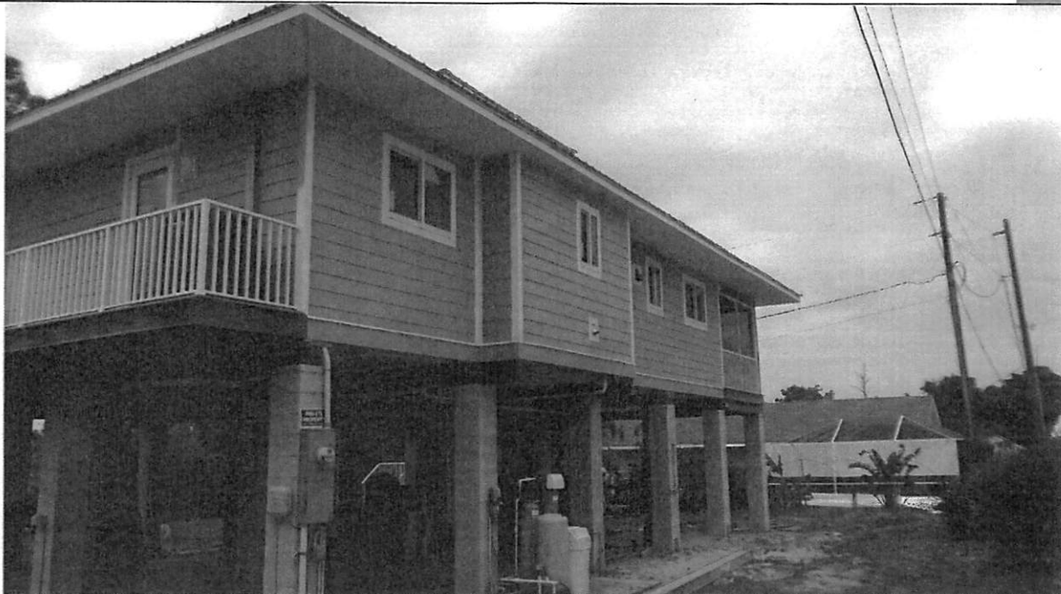
REAR VIEW 04/24/2018