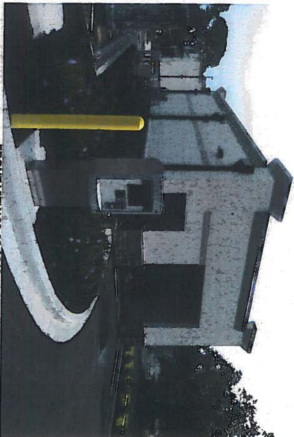
FRONT VIEW 08-06-2019

If using the Elevation Certificate to obtain NFIP flood insurance, affix at least 2 building photographs below according to the instructions for Item A6. Identify all photographs with date taken; "Front View" and "Rear View"; and, if required, "Right Side View" and "Left Side View." When applicable, photographs must show the foundation with representative examples of the flood openings or vents, as indicated in Section A8. If submitting more photographs than will fit on this page, use the Continuation Page.