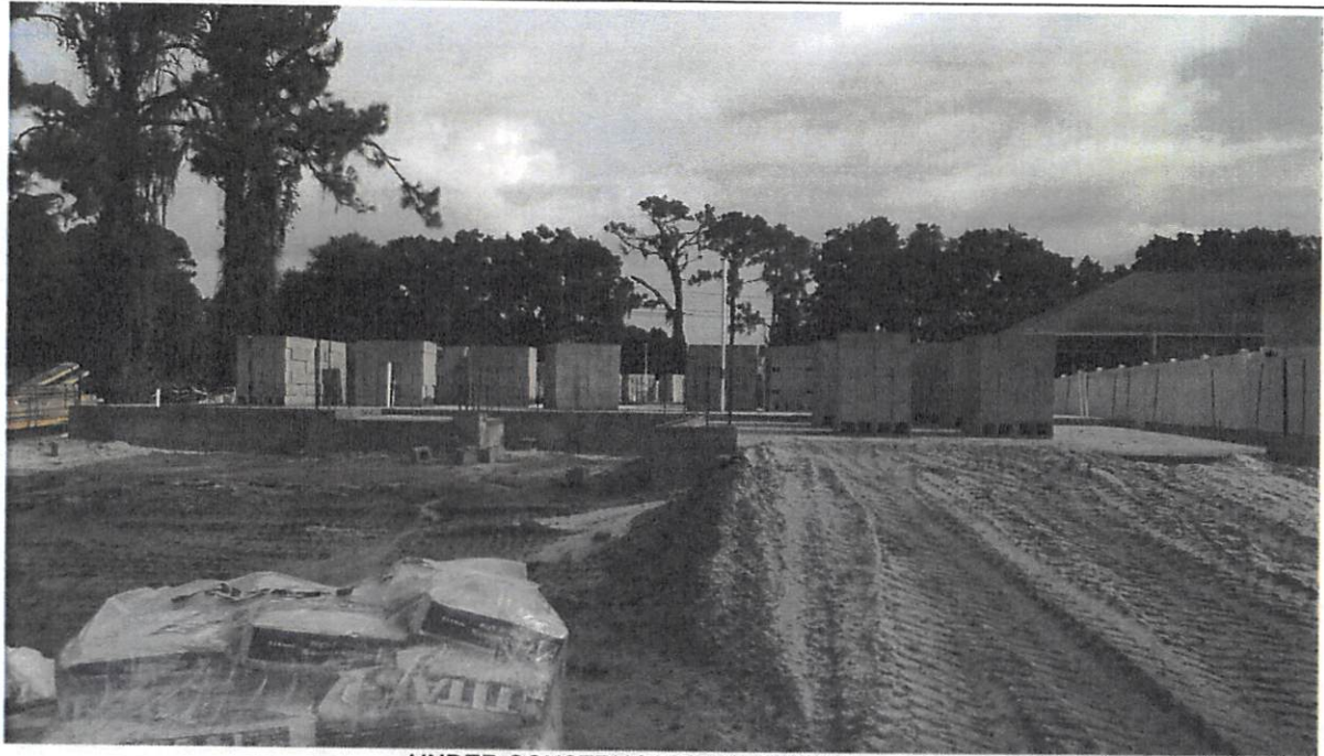
UNDER CONSTRUCTION 08-21-2020

If using the Elevation Certificate to obtain NFIP flood insurance, affix at least 2 building photographs below according to the instructions for Item A6. Identify all photographs with date taken; "Front View" and "Rear View"; and, if required, "Right Side View" and "Left Side View." When applicable, photographs must show the foundation with representative examples of the flood openings or vents, as indicated in Section A8. If submitting more photographs than will fit on this page, use the Continuation Page.