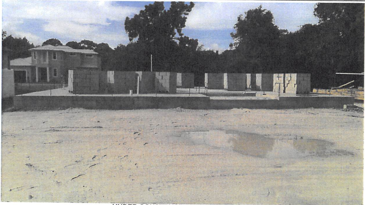
UNDER CONSTRUCTION 08-21-2020