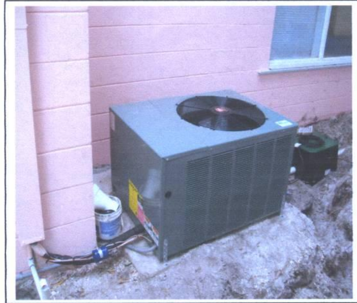
A/C Pad 05/19/10