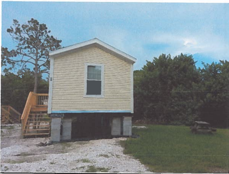
Back View 7/9/14