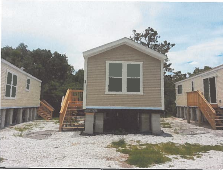
Back View 7/9/14