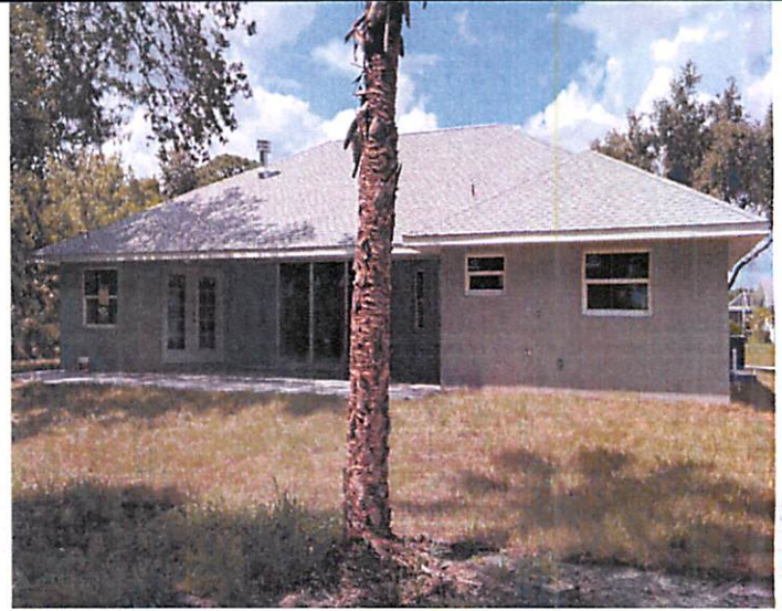
Rear View 08/25/2014