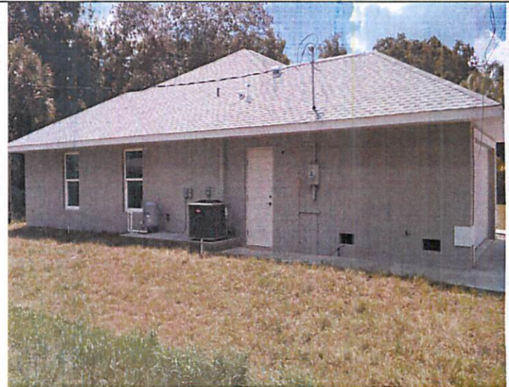
Side View 08/25/2014