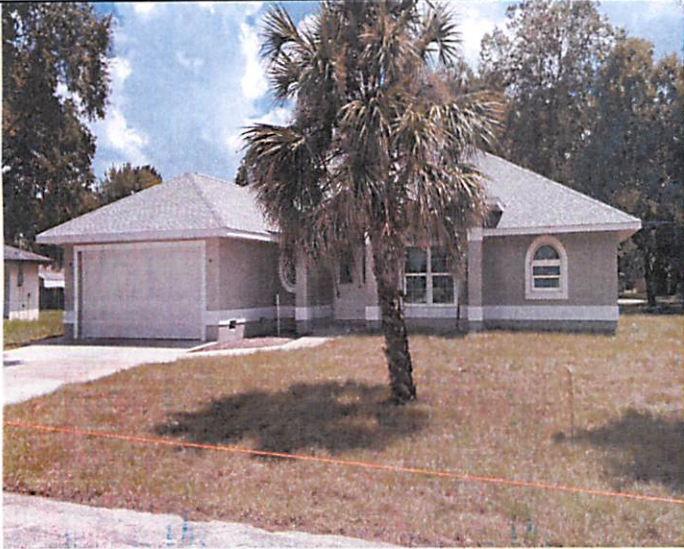
Front View 08/25/2014

If using the Elevation Certificate to obtain NFIP flood insurance, affix at least 2 building photographs below according to the instructions for Item A6. Identify all photographs with date taken; "Front View" and "Rear View"; and, if required, "Right Side View" and "Left Side View." When applicable, photographs must show the foundation with representative examples of the flood openings or vents, as indicated in Section A8. If submitting more photographs than will fit on this page, use the Continuation Page.