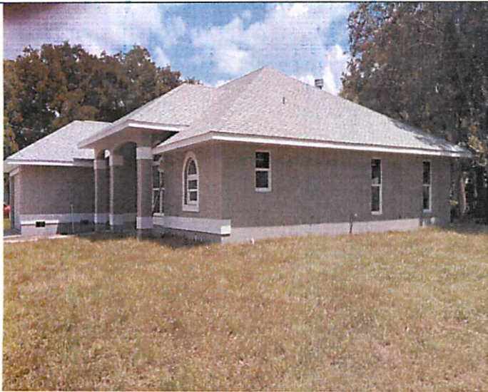
Side View 08/25/2014