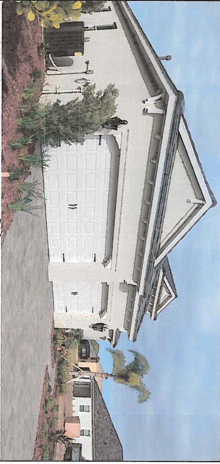
Photo One Caption FRONT 12/20/2019

If using the Elevation Certificate to obtain NFIP flood insurance, affix at least 2 building photographs below according to the instructions for Item A6. Identify all photographs with date taken; "Front View" and "Rear View"; and, if required, "Right Side View" and "Left Side View." When applicable, photographs must show the foundation with representative examples of the flood openings or vents, as indicated in Section A8. If submitting more photographs than will fit on this page, use the Continuation Page.