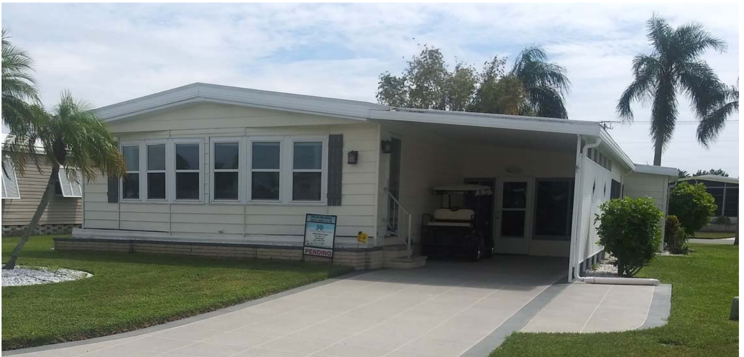
Photo 1 Caption Front View Date Taken 9/30/20

If using the Elevation Certificate to obtain NFIP flood insurance, affix at least 2 building photographs below according to the instructions for Item A6. Identify all photographs with date taken; "Front View" and "Rear View"; and, if required, "Right Side View" and "Left Side View." When applicable, photographs must show the foundation with representative examples of the flood openings or vents, as indicated in Section A8. If submitting more photographs than will fit on this page, use the Continuation Page.