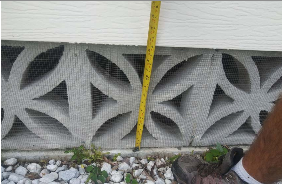
Photo 5 Caption (Typ) Deco Block underneath the Mobile Home JOB# 20-1431 Date Taken 9/30/20

If submitting more photographs than will fit on the preceding page, affix the additional photographs below. Identify all photographs with: date taken; "Front View" and "Rear View"; and, if required, "Right Side View" and "Left Side View." When applicable, photographs must show the foundation with representative examples of the flood openings or vents, as indicated in Section A8.