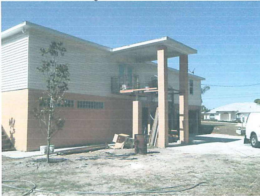
Left Side View 1/30/12