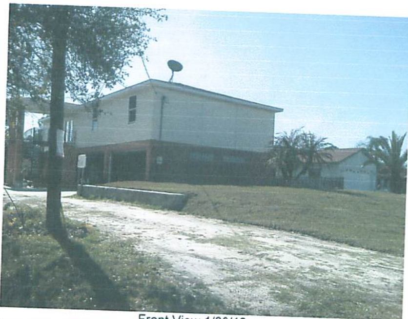
Front View 1/30/12

If using the Elevation Certificate to obtain NFIP flood insurance, affix at least two building photographs below according to the instructions for Item A6. Identify all photographs with: date taken; "Front View" and "Rear View"; and, if required, "Right Side View" and "Left Side View." If submitting more photographs than will fit on this page, use the Continuation Page on the reverse.