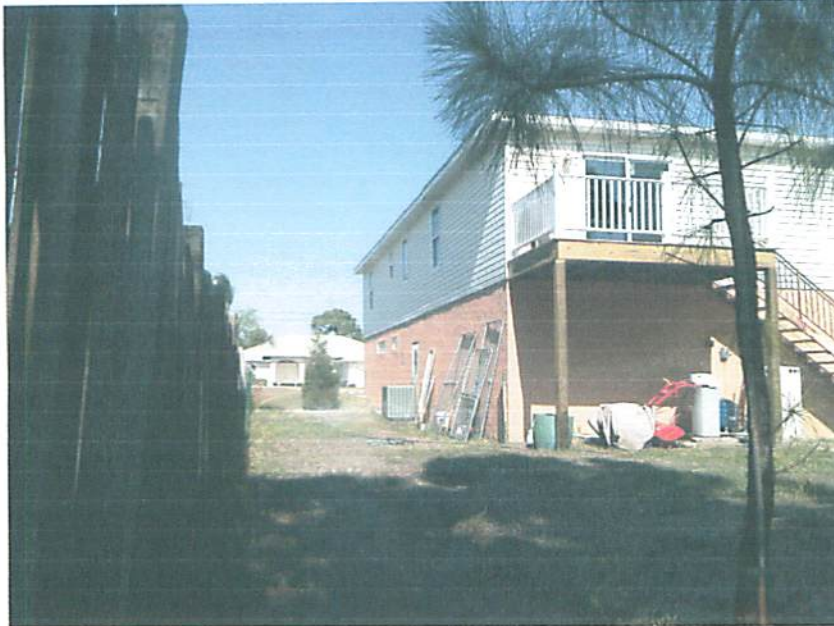
Right Side View 1/30/12

If submitting more photographs than will fit on the preceding page, affix the additional photographs below. Identify all photographs with: date taken; "Front View" and "Rear View"; and, if required, "Right Side View" and "Left Side View."