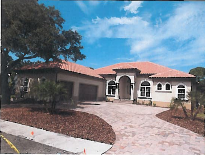
FRONT VIEW 8/4/15

If using the Elevation Certificate to obtain NFIP flood insurance, affix at least 2 building photographs below according to the instructions for Item A6. Identify all photographs with date taken; "Front View" and "Rear View"; and, if required, "Right Side View" and "Left Side View." When applicable, photographs must show the foundation with representative examples of the flood openings or vents, as indicated in Section A8. If submitting more photographs than will fit on this page, use the Continuation Page.