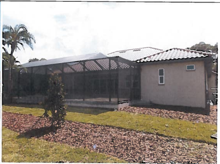
REAR VIEW 8/4/15