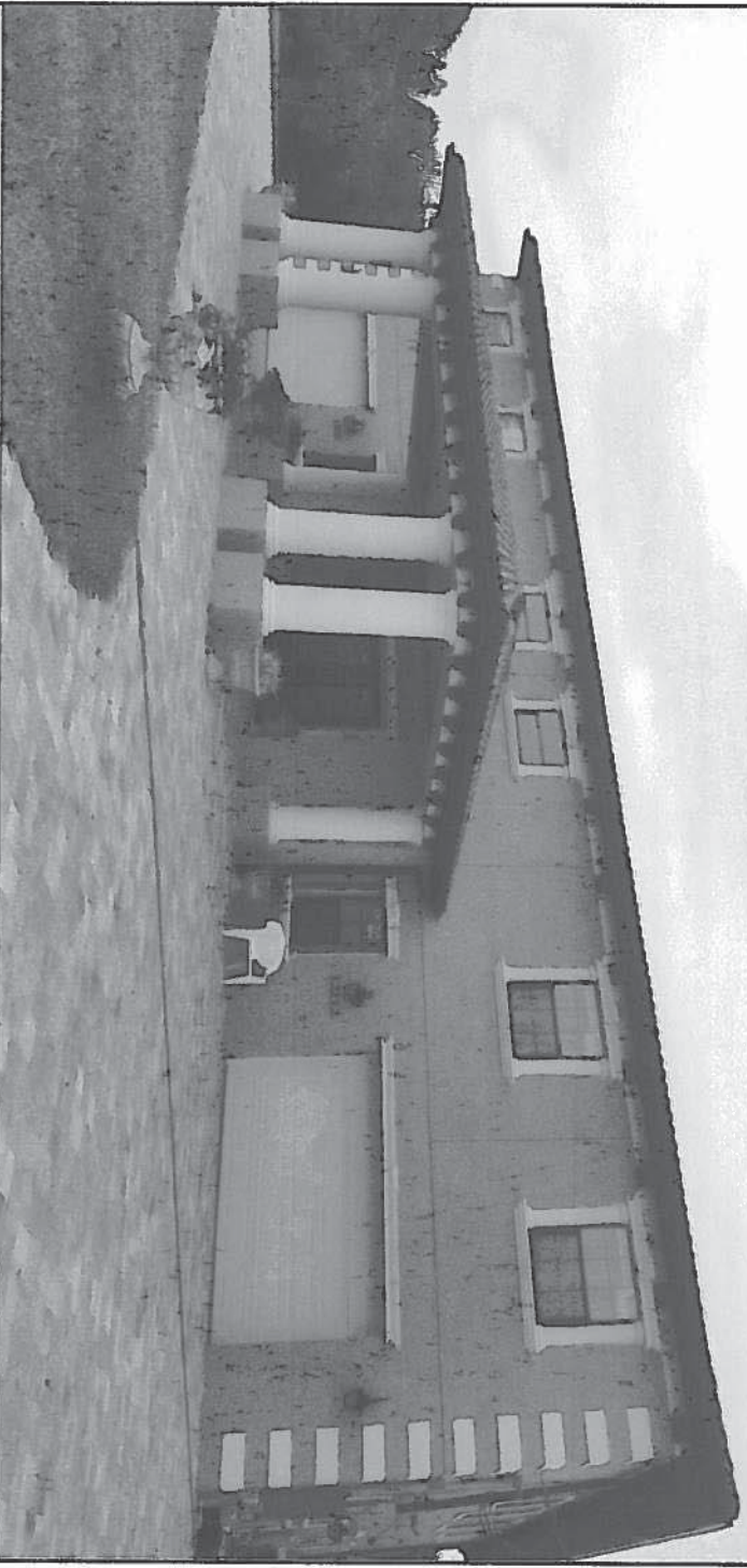
Photo One Caption Front View

If using the Elevation Certificate to obtain NFIP flood insurance, affix at least 2 building photographs below according to the instructions for Item A6. Identify all photographs with date taken, "Front View" and "Rear View"; and, if required, "Right Side View" and "Left Side View." When applicable, photographs must show the foundation with representative examples of the flood openings or vents, as indicated in Section A8. If submitting more photographs than will fit on this page, use the Continuation Page.