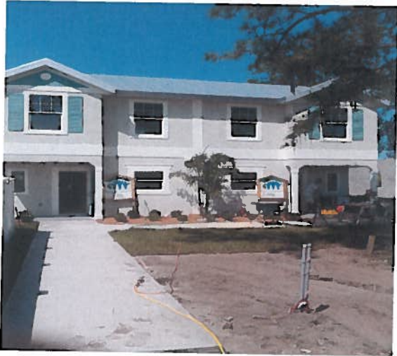
FRONT VIEW 5-6-10

If using the Elevation Certificate to obtain NFIP flood insurance, affix at least two building photographs below according to the instructions for Item A6. Identify all photographs with: date taken; "Front View" and "Rear View"; and, if required, "Right Side View" and "Left Side View." If submitting more photographs than will fit on this page, use the Continuation Page on the reverse.