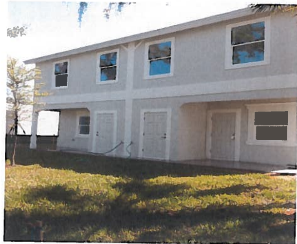
REAR VIEW 5-6-10