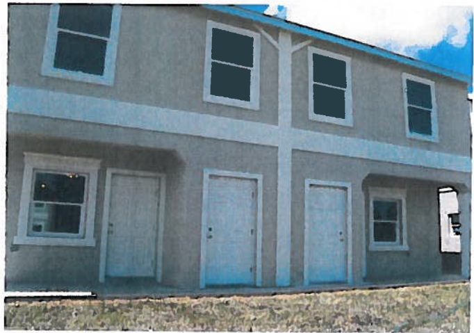
REAR VIEW 9-11-10