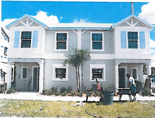
FRONT VIEW 9-11-10