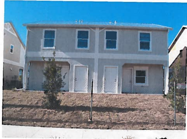
REAR VIEW 12-20-10