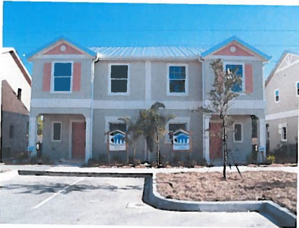
FRONT VIEW 12-20-10

If using the Elevation Certificate to obtain NFIP flood insurance, affix at least two building photographs below according to the instructions for Item A6. Identify all photographs with: date taken; "Front View" and "Rear View"; and, if required, "Right Side View" and "Left Side View." If submitting more photographs than will fit on this page, use the Continuation Page on the reverse.