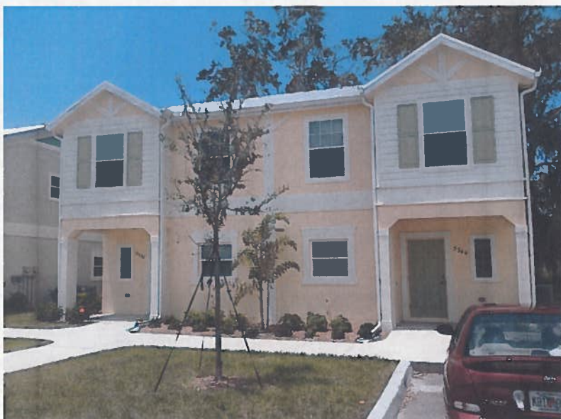
FRONT VIEW 5-23-11

If using the Elevation Certificate to obtain NFIP flood insurance, affix at least two building photographs below according to the instructions for Item A6. Identify all photographs with: date taken; "Front View" and "Rear View"; and, if required, "Right Side View" and "Left Side View." If submitting more photographs than will fit on this page, use the Continuation Page on the reverse.