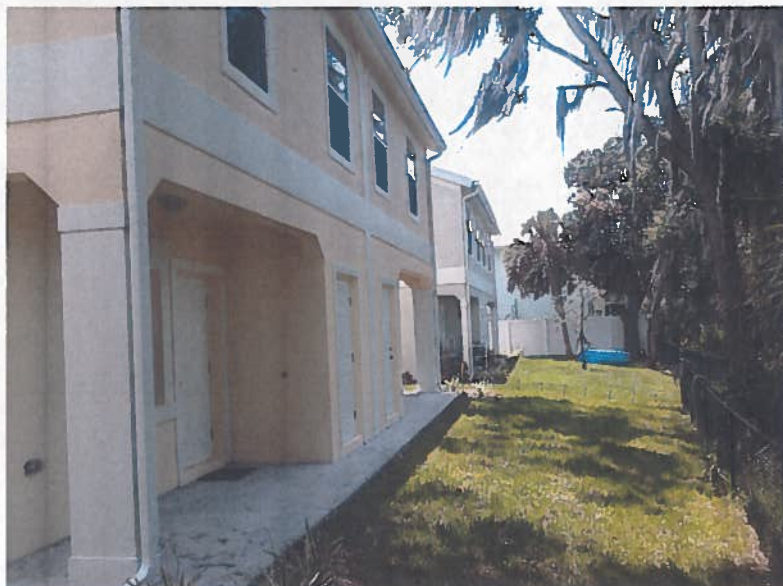
REAR VIEW 5-23-11