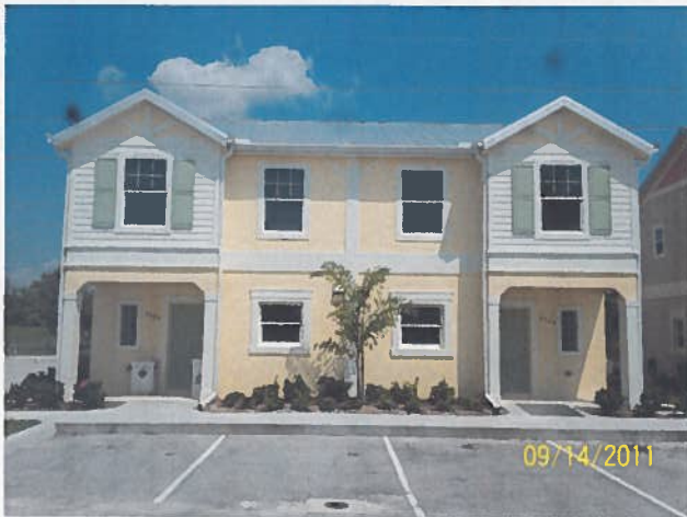
FRONT VIEW 9-14-10

If using the Elevation Certificate to obtain NFIP flood insurance, affix at least two building photographs below according to the instructions for Item A6. Identify all photographs with: date taken; "Front View" and "Rear View"; and, if required, "Right Side View" and "Left Side View." If submitting more photographs than will fit on this page, use the Continuation Page on the reverse.