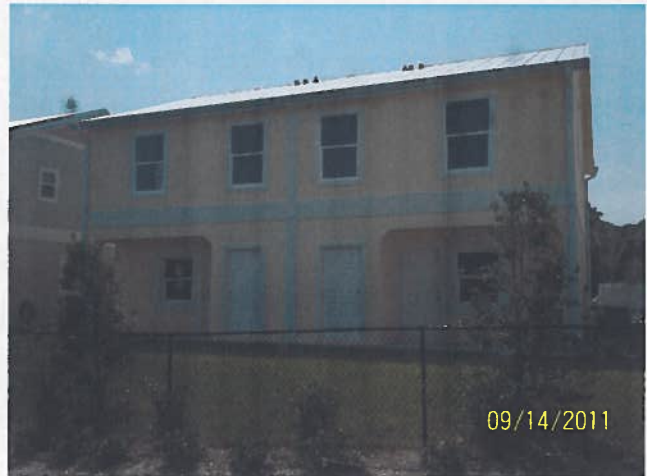
REAR VIEW 9-14-10