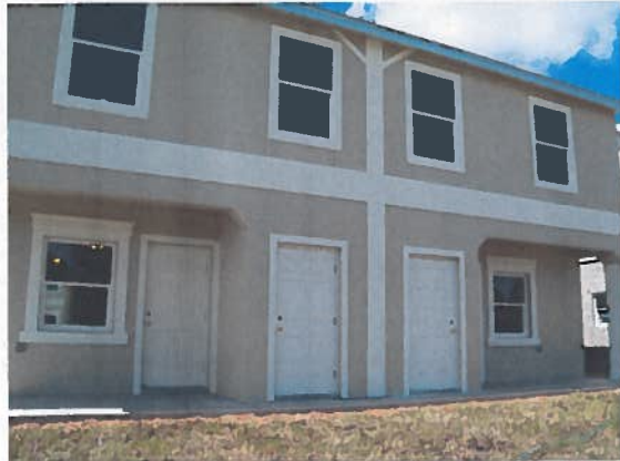
REAR VIEW 5-2-11