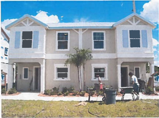
FRONT VIEW 5-2-11