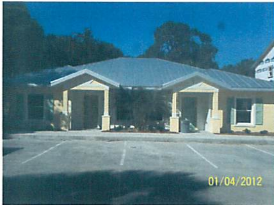
FRONT VIEW 1-4-12

If using the Elevation Certificate to obtain NFIP flood insurance, affix at least two building photographs below according to the instructions for Item A6. Identify all photographs with: date taken; "Front View" and "Rear View"; and, if required, "Right Side View" and "Left Side View." If submitting more photographs than will fit on this page, use the Continuation Page on the reverse.