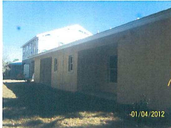
REAR VIEW 1-4-12