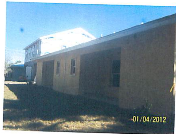
FRONT VIEW 1-4-12