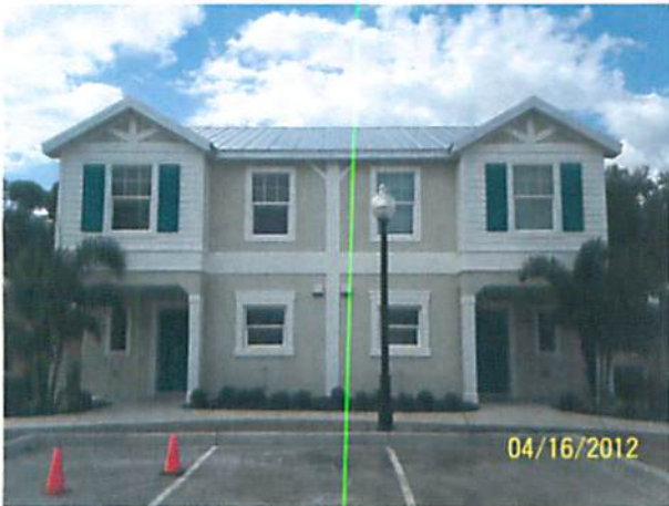
FRONT VIEW 4-16-12

If using the Elevation Certificate to obtain NFIP flood insurance, affix at least two building photographs below according to the instructions for Item A6. Identify all photographs with: date taken; "Front View" and "Rear View"; and, if required, "Right Side View" and "Left Side View." If submitting more photographs than will fit on this page, use the Continuation Page on the reverse.