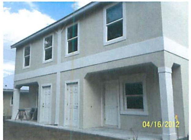
REAR VIEW 4-16-12