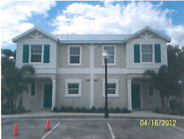
FRONT VIEW 4-16-12

If using the Elevation Certificate to obtain NFIP flood insurance, affix at least two building photographs below according to the instructions for Item A6. Identify all photographs with: date taken; "Front View" and "Rear View"; and, if required, "Right Side View" and "Left Side View." If submitting more photographs than will fit on this page, use the Continuation Page on the reverse.