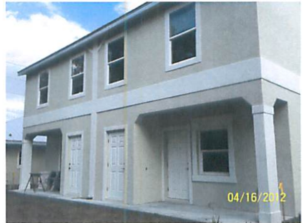
REAR VIEW 4-16-12