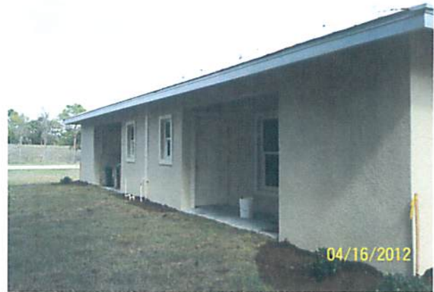
REAR VIEW 4-16-12