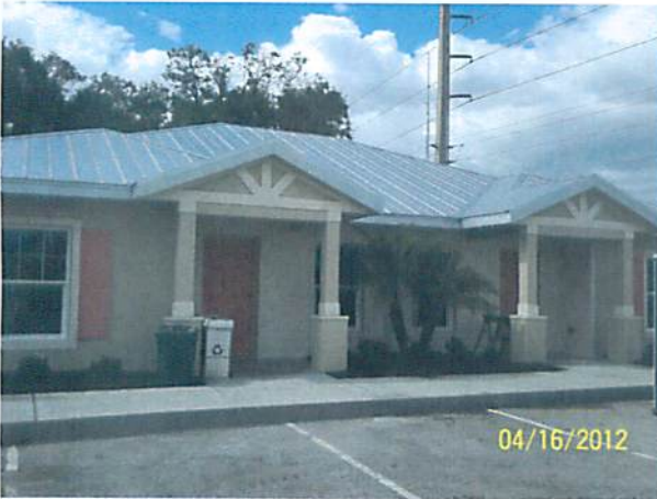
FRONT VIEW 4-16-12

If using the Elevation Certificate to obtain NFIP flood insurance, affix at least two building photographs below according to the instructions for Item A6. Identify all photographs with: date taken; "Front View" and "Rear View"; and, if required, "Right Side View" and "Left Side View." If submitting more photographs than will fit on this page, use the Continuation Page on the reverse.