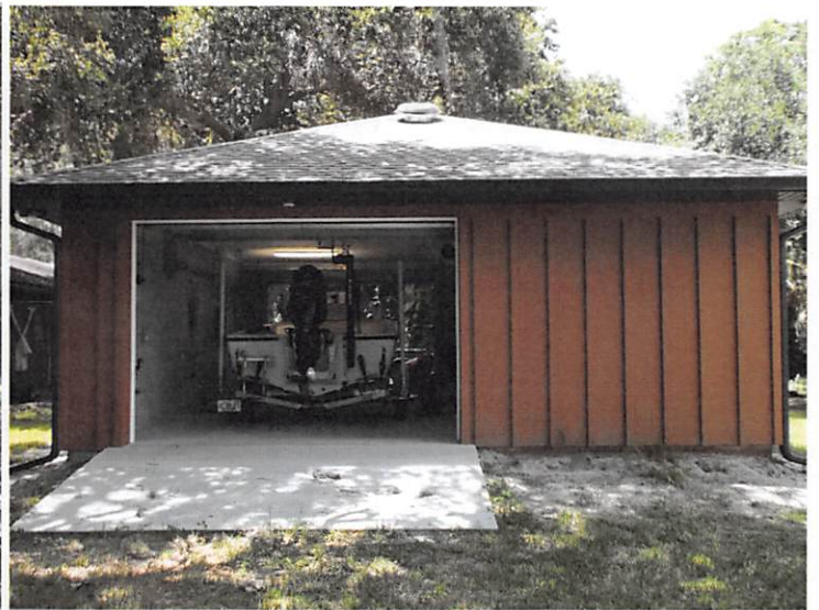
REAR VIEW 8/7/15