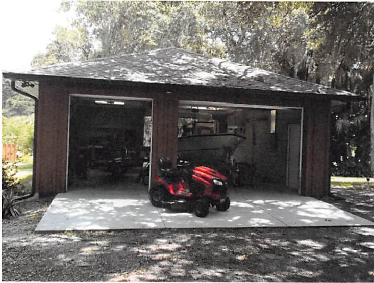
FRONT VIEW 8/7/15

If using the Elevation Certificate to obtain NFIP flood insurance, affix at least 2 building photographs below according to the instructions for Item A6. Identify all photographs with date taken; "Front View" and "Rear View"; and, if required, "Right Side View" and "Left Side View." When applicable, photographs must show the foundation with representative examples of the flood openings or vents, as indicated in Section A8. If submitting more photographs than will fit on this page, use the Continuation Page.