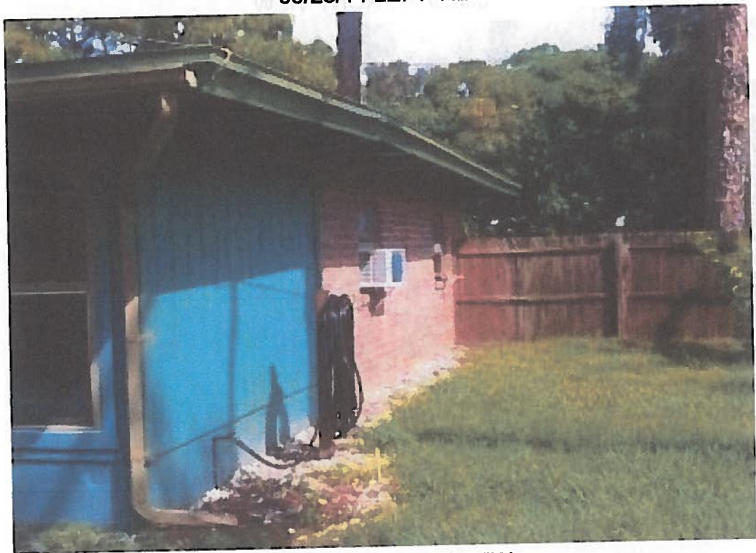
09/23/14 RIGHT VIEW