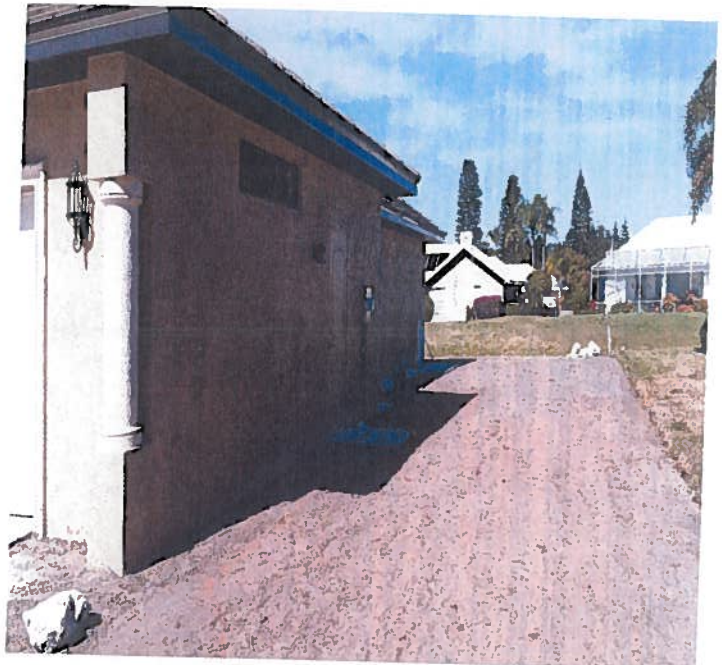
Right Side View Job # 14-1078