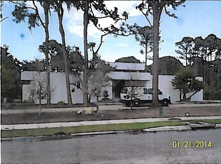
FRONT VIEW 1/21/14

If using the Elevation Certificate to obtain NFIP flood insurance, affix at least 2 building photographs below according to the instructions for Item A6. Identify all photographs with date taken; "Front View" and "Rear View"; and, if required, "Right Side View" and "Left Side View." When applicable, photographs must show the foundation with representative examples of the flood openings or vents, as indicated in Section A8. If submitting more photographs than will fit on this page, use the Continuation Page.