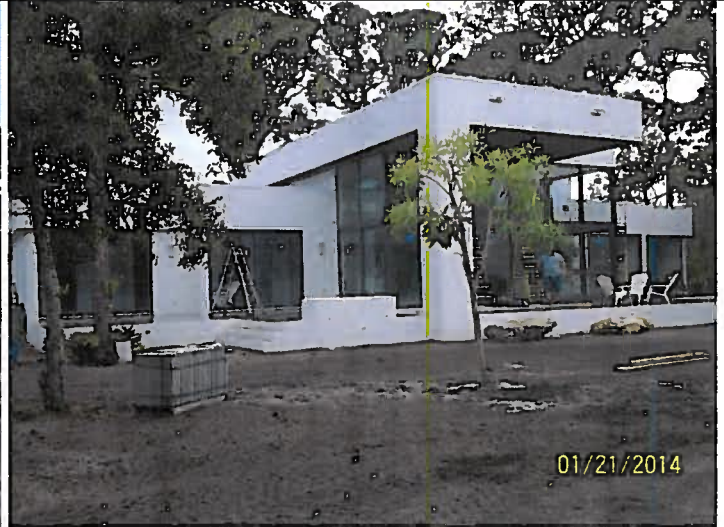
REAR VIEW 1/21/14