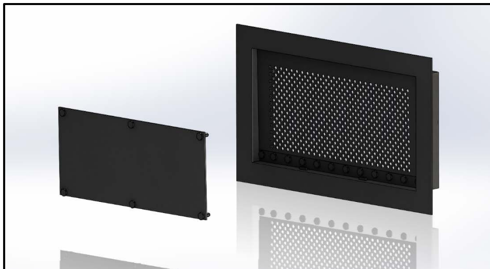
FIGURE 1—MODEL FFV-1608 FREEDOM FLOOD VENT®: SHOWN WITH COVER REMOVED