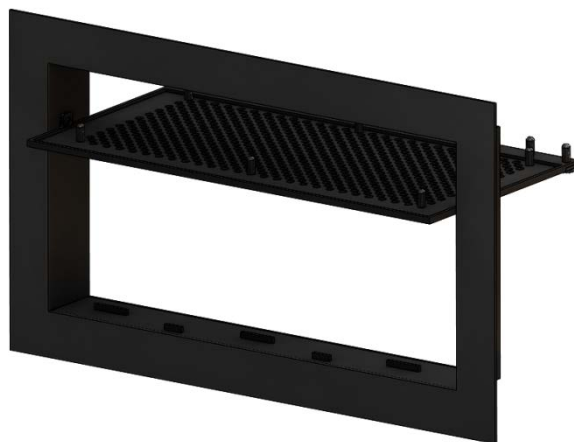
FIGURE 2—MODEL FFV-1608 FREEDOM FLOOD VENT®: SHOWN WITH FLOOD DOOR PIVOTED OPEN