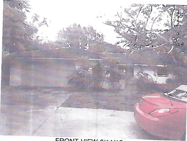
FRONT VIEW 6/11/15

If using the Elevation Certificate to obtain NFIP flood insurance, affix at least 2 building photographs below according to the instructions for Item A6. Identify all photographs with date taken; "Front View" and "Rear View"; and, if required, "Right Side View" and "Left Side View." When applicable, photographs must show the foundation with representative examples of the flood openings or vents, as indicated in Section A8. If submitting more photographs than will fit on this page, use the Continuation Page.