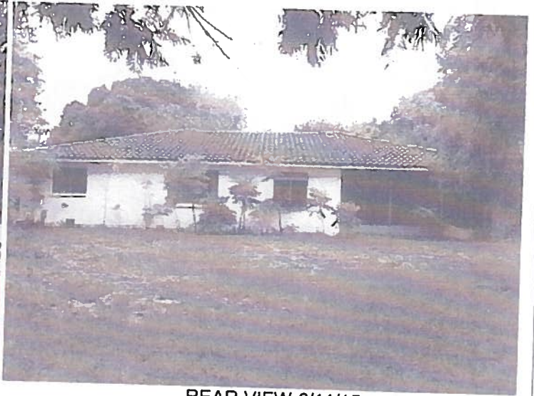
REAR VIEW 6/11/15