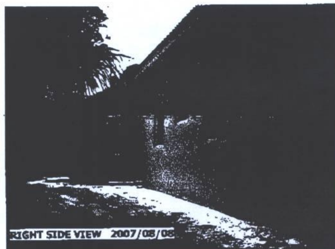
06-11-19-D JOHNNY 8-8-07.JPG