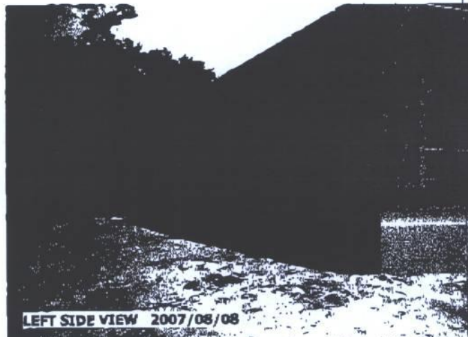
06-11-19-B JOHNNY 8-8-07.JPG