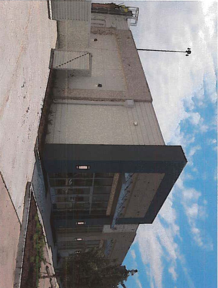
Photo Two Caption Side of Building under construction (Taken 05-05-2021)