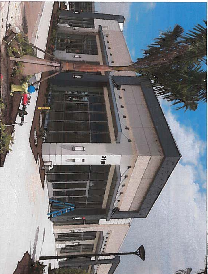
Photo One Caption Front of Building under construction (Taken 05-05-2021)

If using the Elevation Certificate to obtain N-FIP flood insurance, affix at least 2 building photographs below according to the instructions for Item A6. Identify all photographs with date taken; "Front View" and "Rear View"; and, if required, "Right Side View" and "Left Side View." When applicable, photographs must show the foundation with representative examples of the flood openings or vents, as indicated in Section A8. If submitting more photographs than will fit on this page, use the Continuation Page.