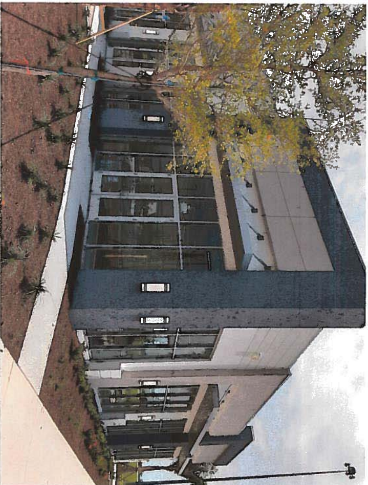
Photo Three Caption Rear of Building View (Taken 05-05-2021)

If submitting more photographs than will fit on the preceding page, affix the additional photographs below. Identify all photographs with: date taken; "Front View" and "Rear View"; and, if required, "Right Side View" and "Left Side View." When applicable, photographs must show the foundation with representative examples of the flood openings or vents, as indicated in Section A8.