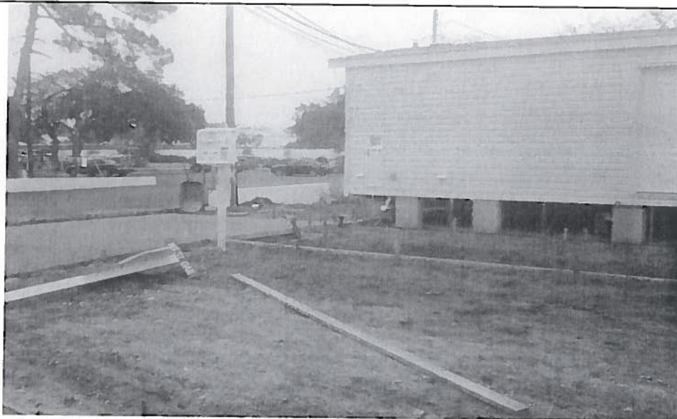
Front looking Southeast

If using the Elevation Certificate to obtain NFIP flood insurance, affix at least two building photographs below according to the instructions for Item A6. Identify all photographs with: date taken; "Front View" and "Rear View"; and, if required, "Right Side View" and "Left Side View." If submitting more photographs than will fit on this page, use the Continuation Page, following.