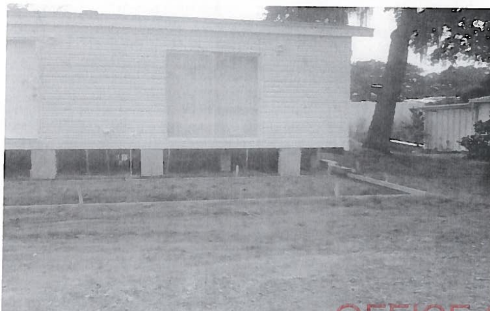
Front looking Southwest