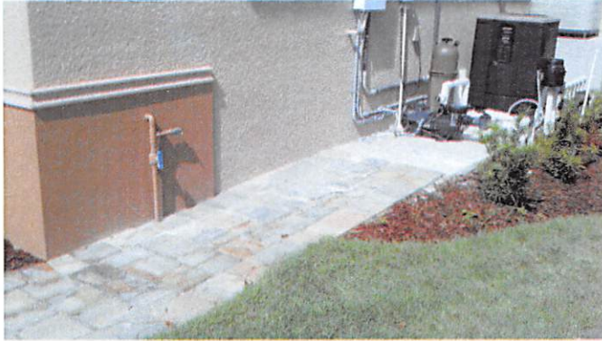
North Side of House: