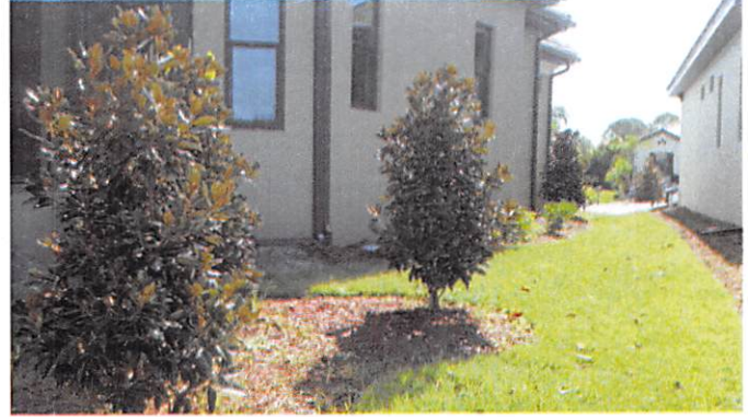
South Side of House: