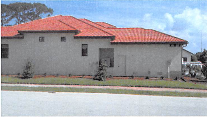
South Side View:

If submitting more photographs than will fit on the preceding page, affix the additional photographs below. Identify all photographs with: date taken; "Front View" and "Rear View"; and, if required, "Right Side View" and "Left Side View." When applicable, photographs must show the foundation with representative examples of the flood openings or vents, as indicated in Section A8.