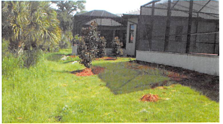
Rear / South Side View: