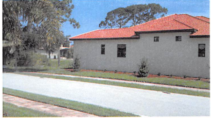
Engineered Flood Vents (North Side):