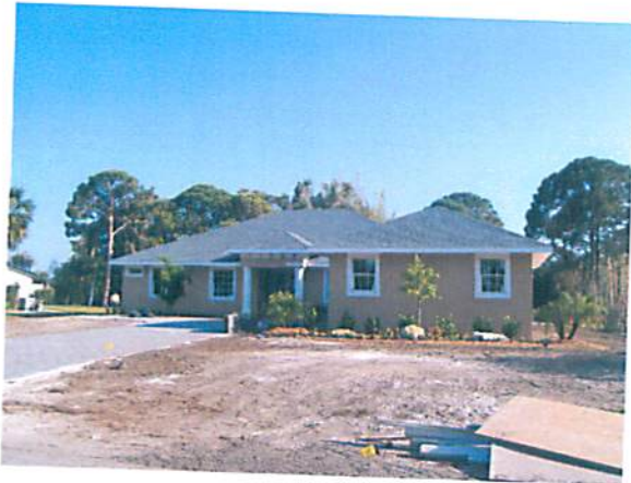
FRONT VIEW 4-1-13

If using the Elevation Certificate to obtain NFIP flood insurance, affix at least 2 building photographs below according to the instructions for Item A6. Identify all photographs with date taken; "Front View" and "Rear View"; and, if required, "Right Side View" and "Left Side View." When applicable, photographs must show the foundation with representative examples of the flood openings or vents, as indicated in Section A8. If submitting more photographs than will fit on this page, use the Continuation Page.