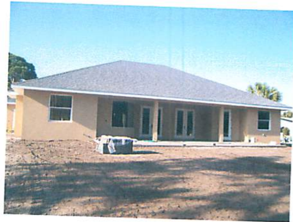
REAR VIEW 4-1-13