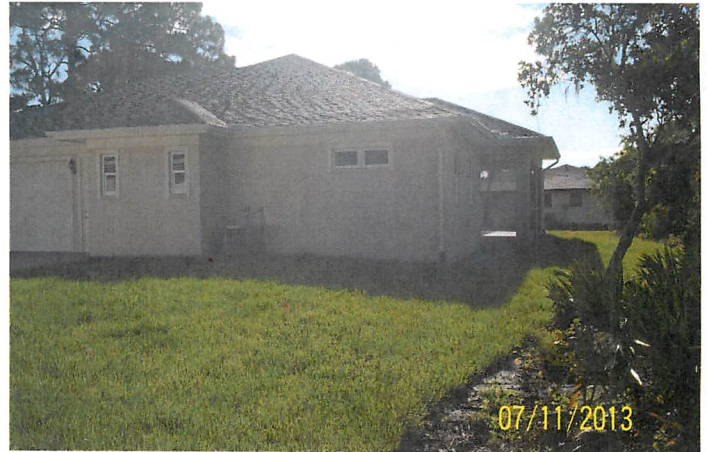
FRONT VIEW 7-11-13